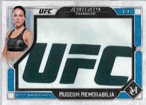
Museum Memorabilia Card