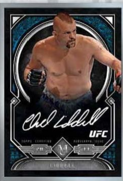
Museum Collection Autograph Card - Silver Framed Parallel

NEW! Museum Autographs – A premier checklist of UFC athletes showcasing current, retired and newly debuting fighters. Autographs will be signed on the card! Base version will be numbered to 99 or less.