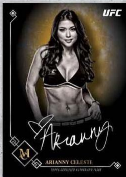
Museum Autograph Card - Gold Parallel