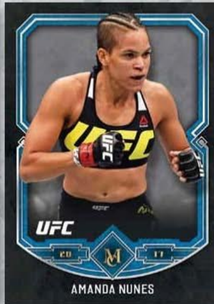
Base Card - Sapphire Parallel