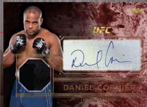
Top of the Class Autograph Relic Card - Red Parallel