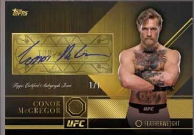
Top of the Class Autograph Card - Gold Parallel