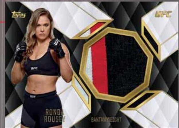
Top of the Class Relic Card