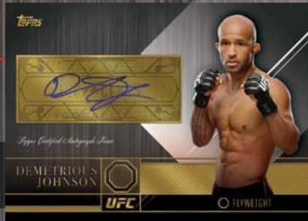
Top of the Class Autograph Card